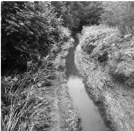
A new path will be created beside the old path seen here, which frequently floods, on slightly raised ground.

During the work, the path will need to be closed to the public for a period of time. Announcements will appear in the press and signs will be erected at the start of the path at the appropriate time. There will also be notices and maps showing alternative access to Lady Mary's walk via Laggan Road.