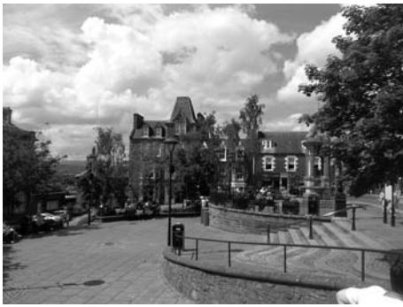
James Square looking lovely with its new paint job