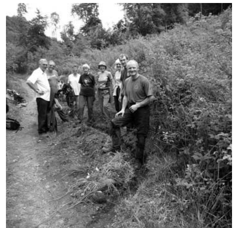
Volunteers working on the path at Trowan