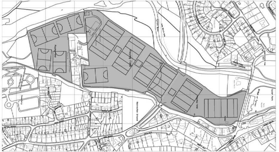
Possible new sports provision at Morrison's Academy's playing fields at Dallerie

For more information please call Morrison's Academy on 01764 653885 or email enquiries@morrisonssacademy.org