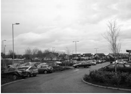
Parking is often a problem at the Campus

Email: crieffcommunitytrust@gmail.com Phone: 01764 650134 / 07789 044550 www.crieffcommunitytrust.org.uk