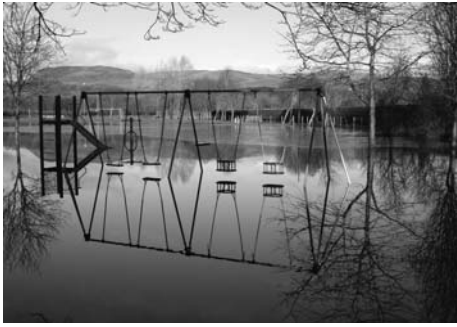
Frequent flooding makes Braidhaugh unusable